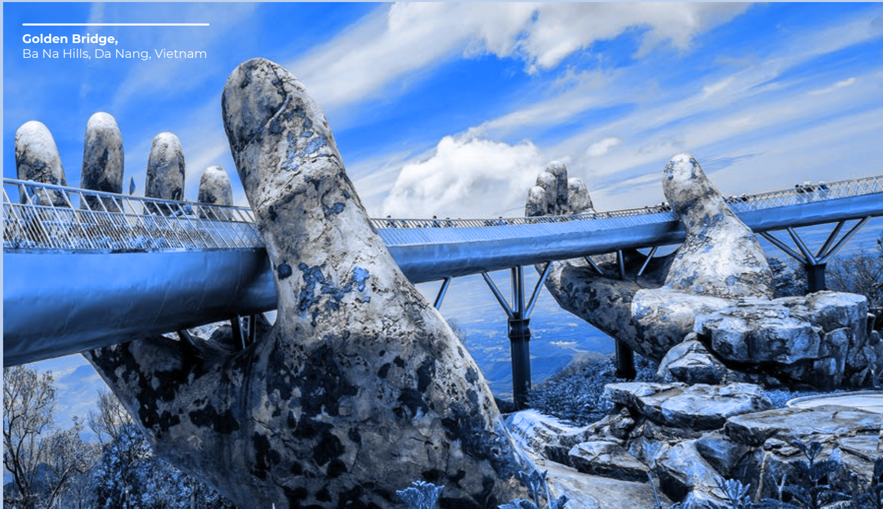
Golden Bridge, Ba Na Hills, Da Nang, Vietnam

All Directors, General Managers and Employees of Mapei Group Companies (hereinafter “ Mapei People ” or “employees”) and the other entities, subjects and companies acting in the name or on behalf of the Mapei Group (hereinafter “ addressees of the Code ”, including “ Mapei People ”) must carry out their activities, tasks and responsibilities in compliance with the principles, values and rules defined within this Code. Observance of the Code of Ethics is considered an essential requirement of their contractual obligations for all Mapei People.