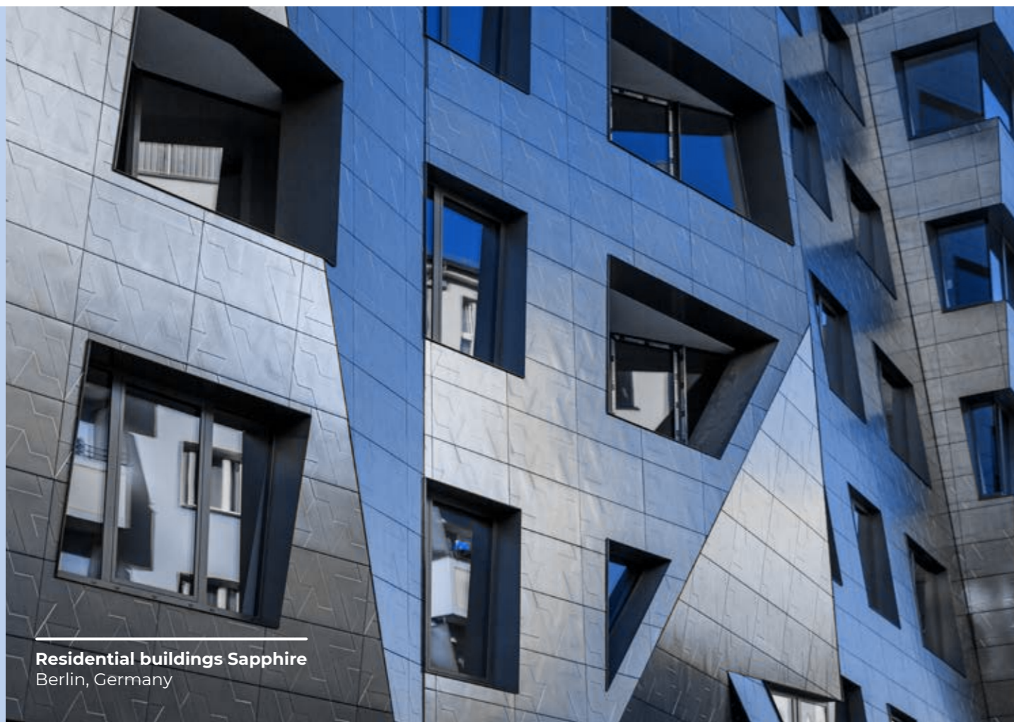
Residential buildings Sapphire Berlin, Germany

It is permissible to make appropriate gifts, donations, sponsorships or organise entertainment in a given situation. Exchanging gifts of a modest value commonly accepted at international level can enforce and develop business relationships; sponsoring an event or arranging entertainment foster a positive reputation for the Mapei Group and donating to charitable causes is a way to give back to communities in the countries where Mapei does business.