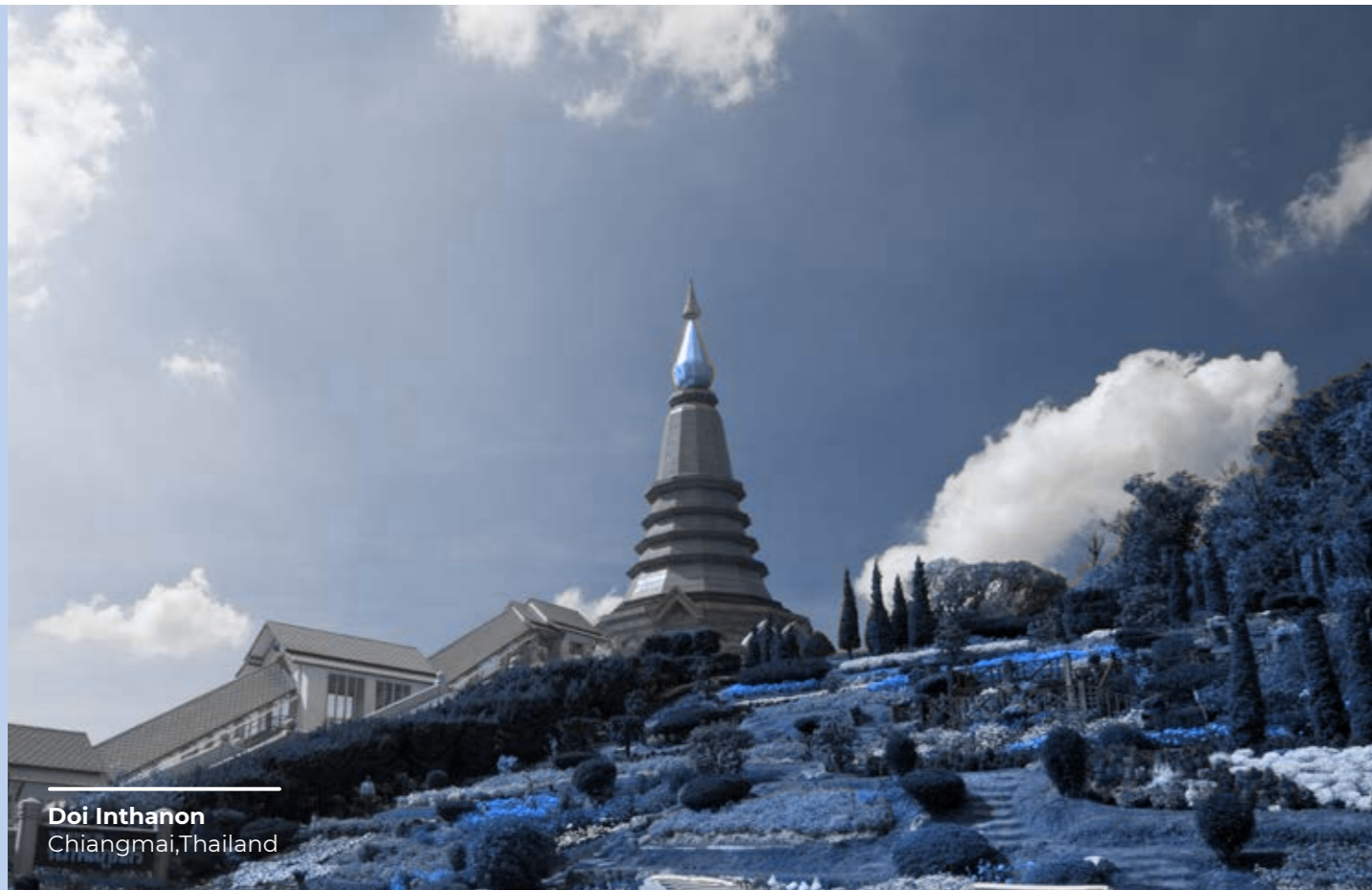
Doi Inthanon Chiangmai, Thailand