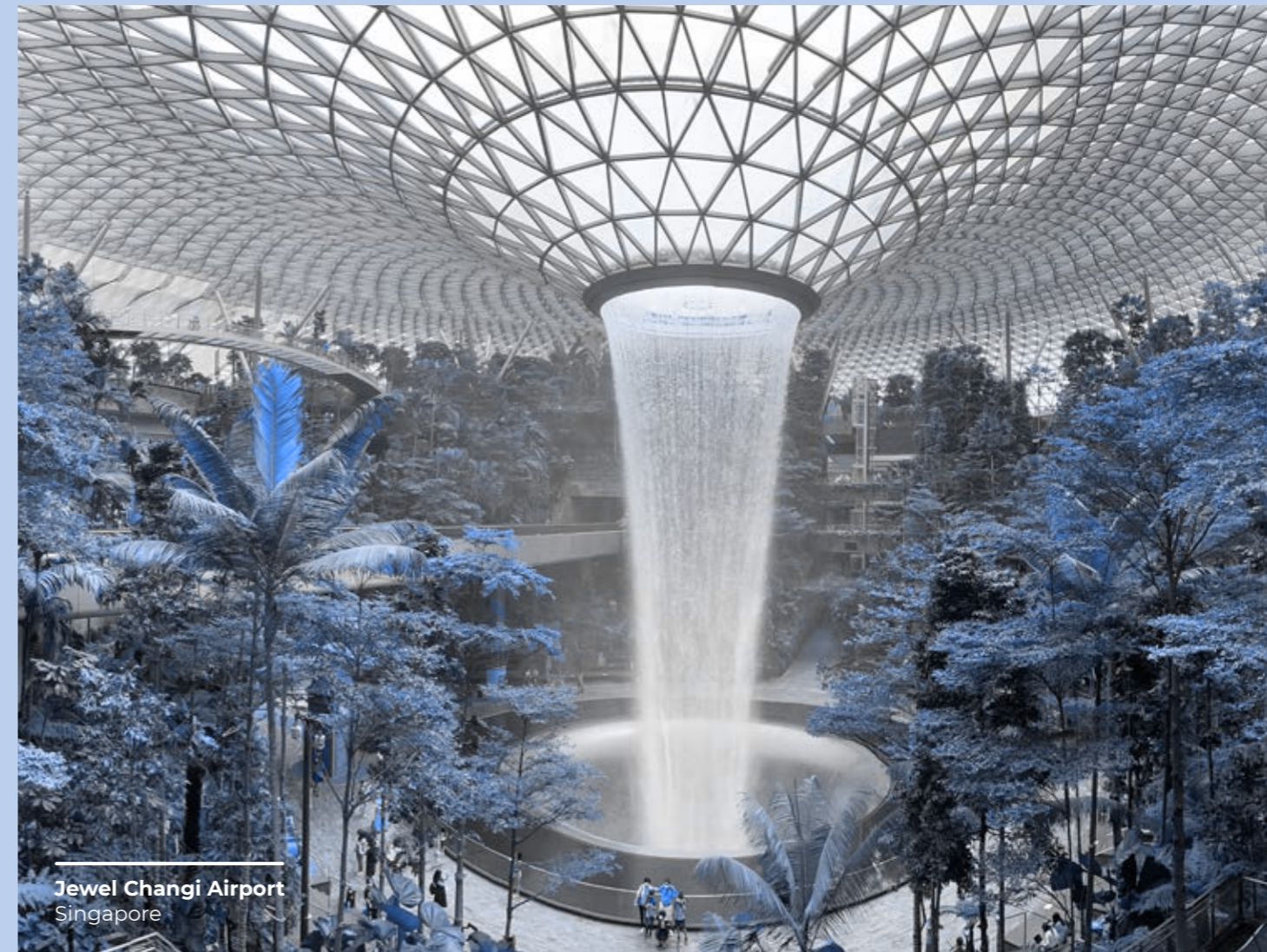
Jewel Changi Airport Singapore

Any employee or other individual's data which it is necessary to collect during employment will be confidential and accessible or transferred only for legitimate and appropriate purposes.