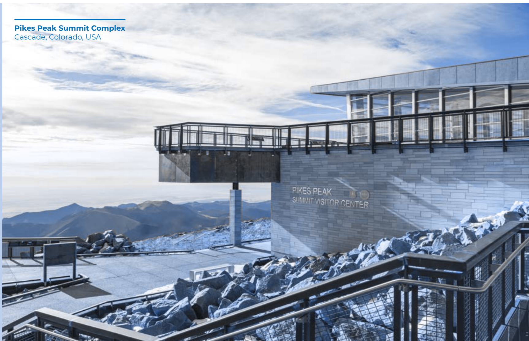
Pikes Peak Summit Complex Cascade, Colorado, USA

In any case, it is prohibited for all Mapei People to accept or request promises or payments in cash, assets or benefits, or services of any kind that may in any way be aimed at fostering the hiring of a specific person as an employee or of their transfer or promotion.