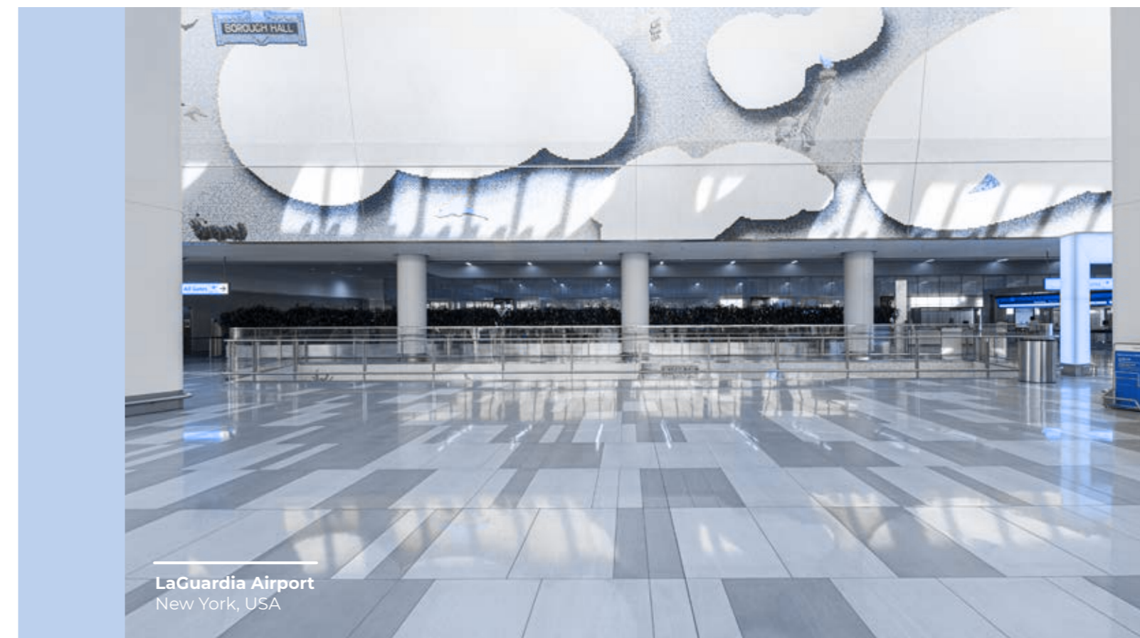
LaGuardia Airport New York, USA