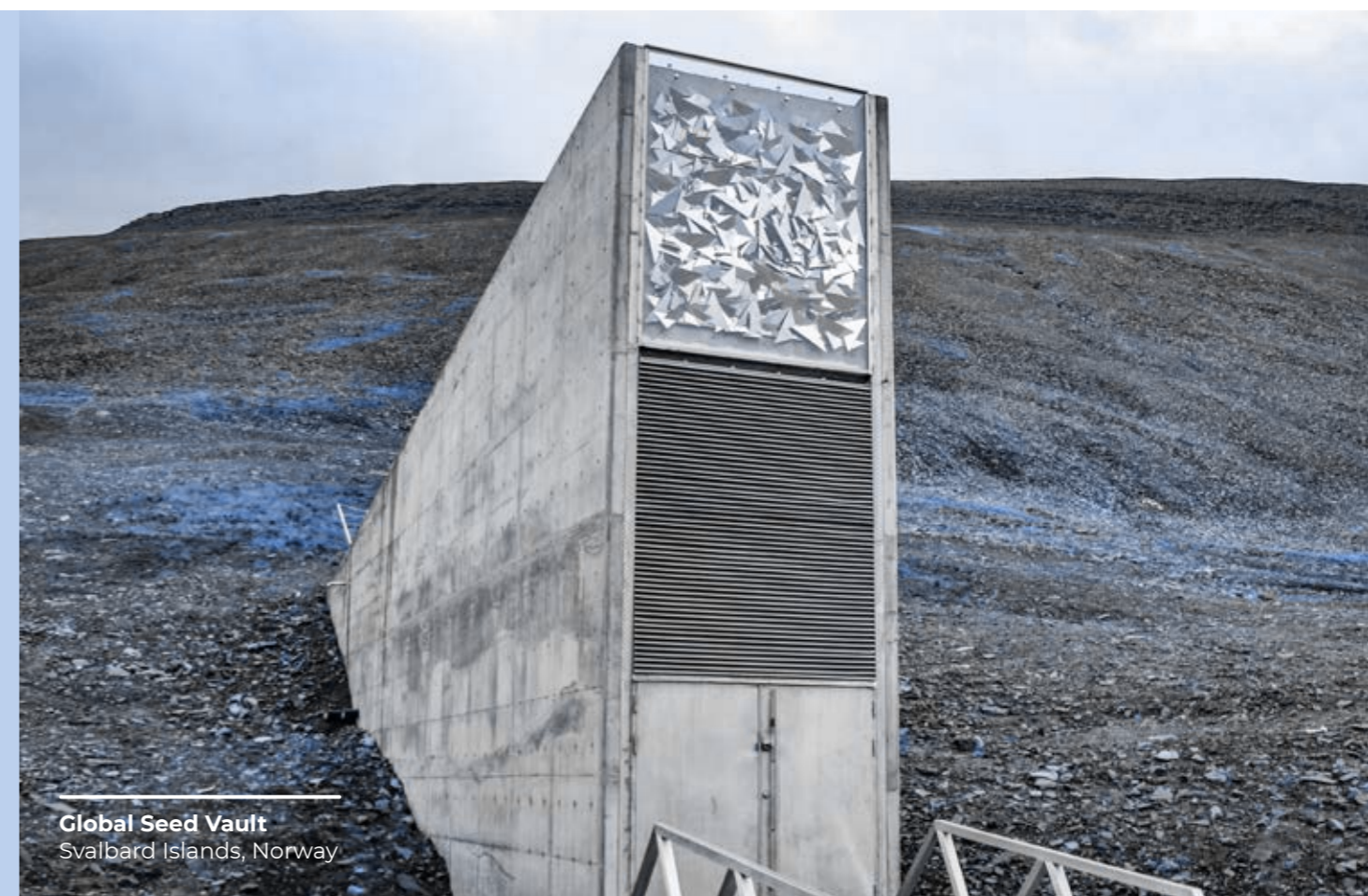
Global Seed Vault Svalbard Islands, Norway

Record and report to your line manager and Corporate Internal Audit any suspected fraudulent situations and any cases of fraud that have occurred.