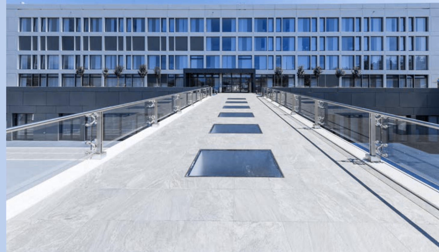
De La Tour Hospital Meyrin, Switzerland

by the Corporate Internal Audit and HR Corporate & Organization Departments) or through the online Whistleblowing Portal.