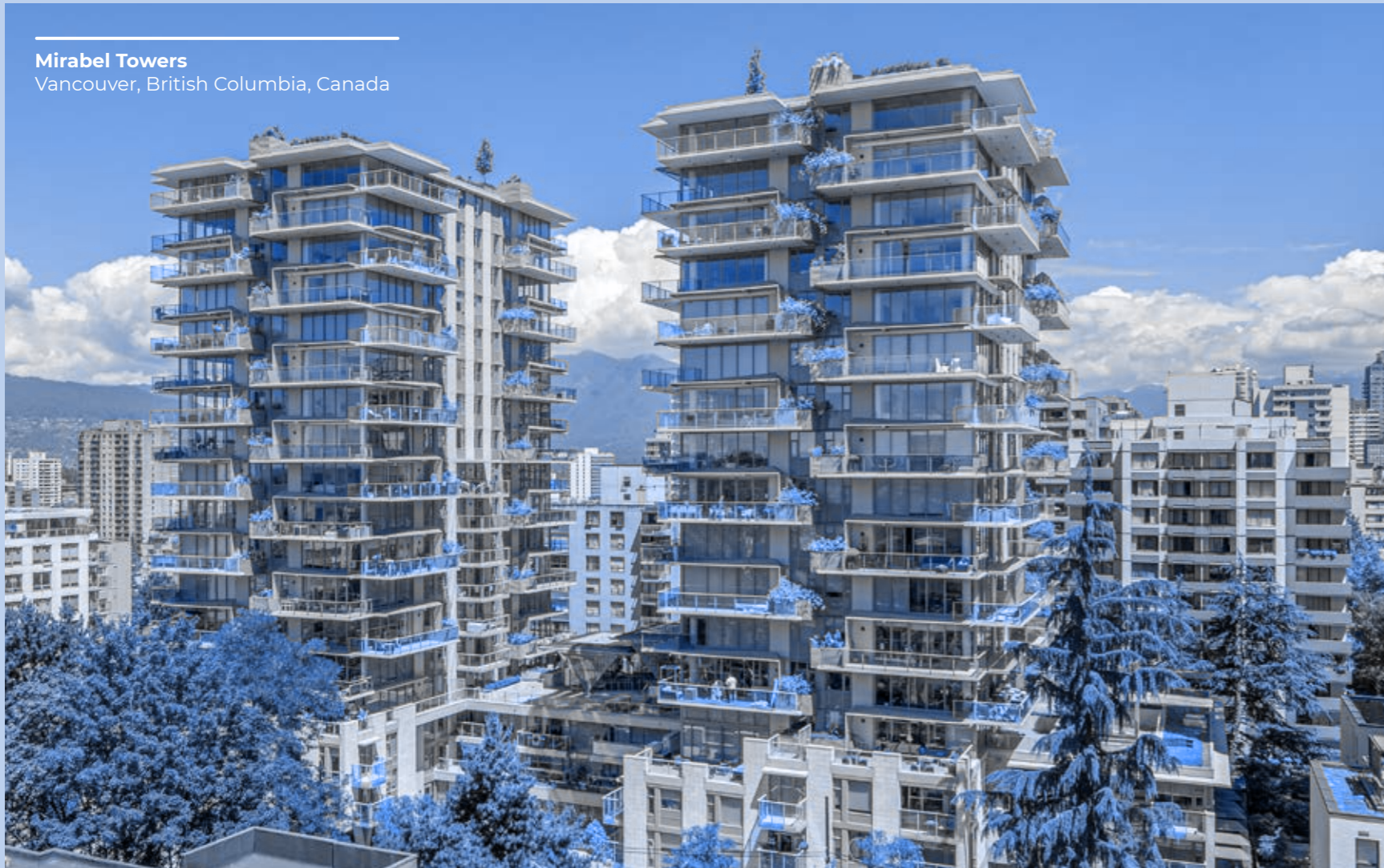
Mirabel Towers Vancouver, British Columbia, Canada